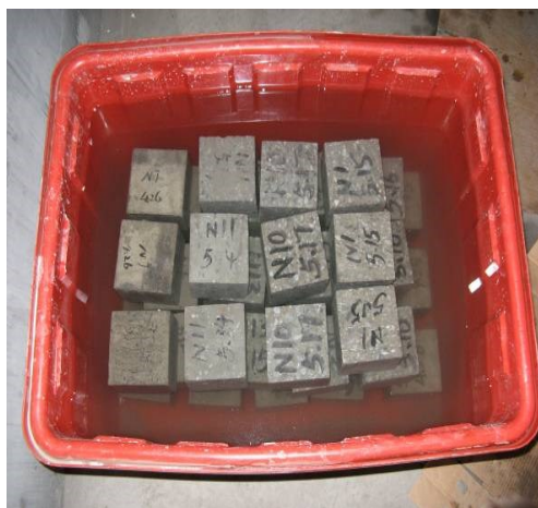
Figure 3. – Specimen soaked in sulfate

Five groups of specimens N1, N3, N4, N10, and N13 were selected for the sulfate corrosion resistance test. Through comparative analysis, the corrosion resistance in pure cement, single-mixed fly ash, single-mixed mineral powder, compounded with various mineral admixtures and health-preserving conditions were analyzed. The ability of shotcrete to resist sulfate corrosion under different conditions, the test results of shotcrete against sulfuric acid corrosion are shown in Table 1, Figures 3-4.