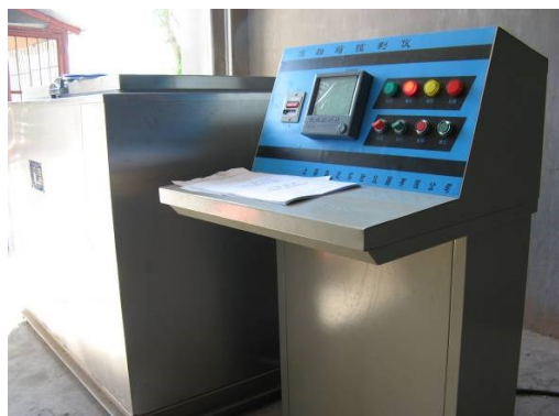
Figure 7. – Freeze-thaw cycle device