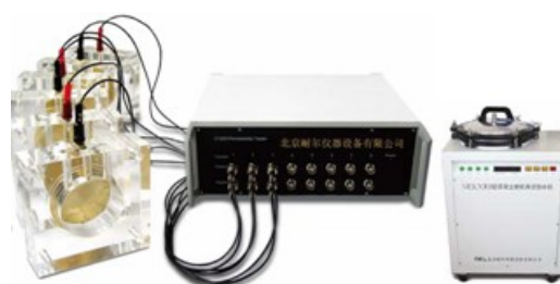
Figure 2. – Electric flux measuring instrument

Five groups of specimens N1, N3, N4, N10, and N13 were selected for the sulfate corrosion resistance test. Through comparative analysis, the corrosion resistance in pure cement, single-mixed fly ash, single-mixed mineral powder, compounded with various mineral admixtures and health-preserving conditions were analyzed. The ability of shotcrete to resist sulfate corrosion under different conditions, the test results of shotcrete against sulfuric acid corrosion are shown in Table 1, Figures 3-4.