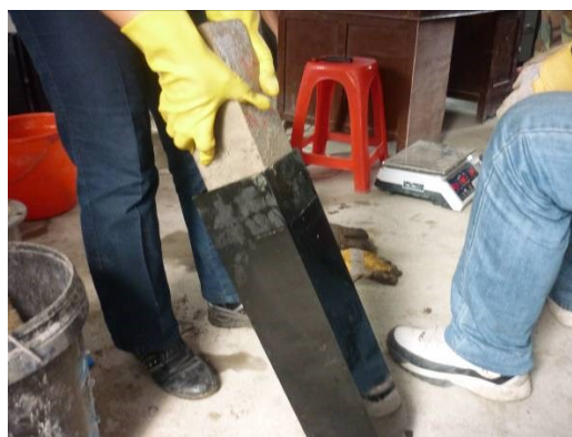
Figure 6. – Place the test piece