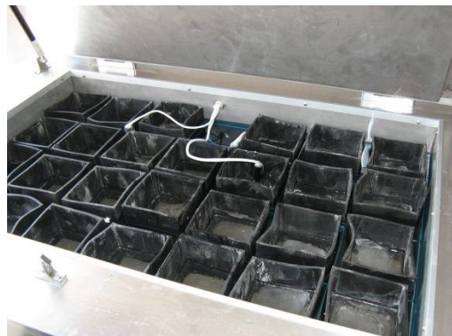
Figure 8. – Antifreeze test piece