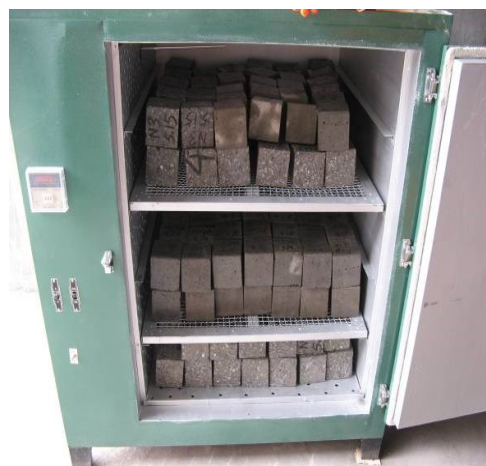
Figure 4. – Drying the specimen