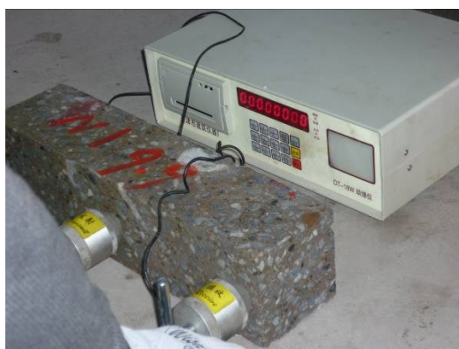
Figure 5. – Measure the fundamental frequency

Five groups of mix ratios N1, N3, N4, N10, and N13 were selected for antifreeze tests. Through comparative analysis, the conditions of pure cement, single-mixed fly ash, single-mixed mineral powder, mixed with various mineral admixtures, and different health conditions were analyzed. The anti-freeze ability of shotcrete under the above conditions, the results of anti-freeze test of shotcrete are shown in Table 2, Figures 5-8.